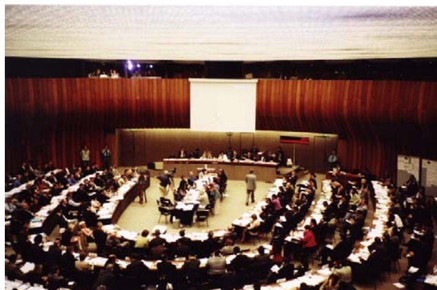
The 59 th Session of the UN Commission on Human Rights