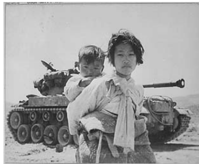
Korea, 1951