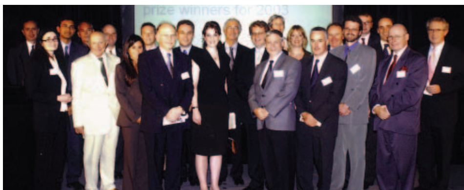
Sponsor representatives at the Monash Law School Prize Ceremony.