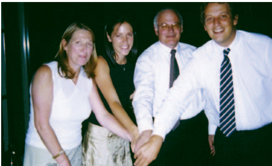
The first LLM(LP) graduates at a special celebratory dinner held in February.

The LLM(LP) is a unique degree that combines the requirements for a qualifying law degree with the practical legal training that allows graduates to be directly admitted to legal practice without completing a year of articles. It is the flagship of the Monash Law School's postgraduate practical legal education, and has become highly attractive to mature professionals wishing to change or enhance their career.