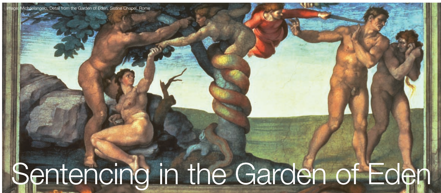
Image: Michelangelo, Detail from the Garden of Eden, Sistine Chapel, Rome

November 2005 News from the Monash Law School community